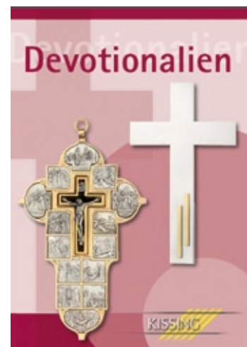
Our Devotional Objects catalogue.

If you are interested in unusual and artistically designed symbols of faith, please ask for our multiple page catalogue. You can also download this directly from the Internet. We supply a wide range of crosses, medals and rosaries. Since we are manufacturer, we also supply individual symbols of faith entirely according to your wishes. A handcrafted wall cross with embossed motifs representing Christ's stations of the cross is shown on the cover of our catalogue. We have been producing the unchanged form of this metal cross for more than 100 years. It is particularly distinguished by its masterful workmanship.