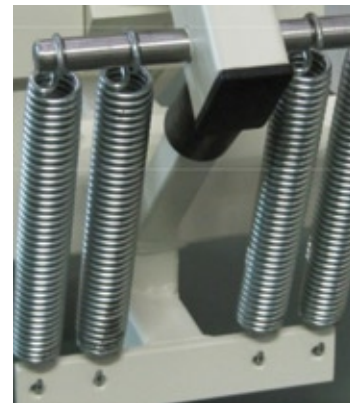
A spring balancer makes opening and closing the upper backing plate easier.

The old type baking irons can also be retrofitted. Some customers have already asked for a spring assembly and have replaced the gas pressure spring. The conversion to spring balancer is very simple. Detailed assembly instructions are included so that professional retrofitting succeeds. If you are